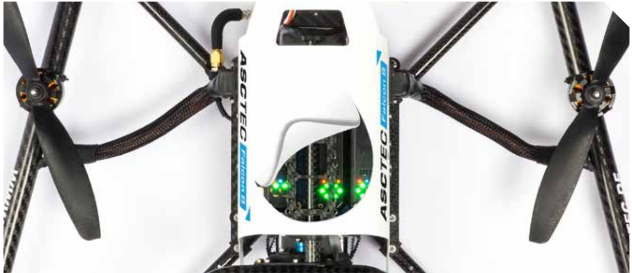
▼ A new era of flight control & a new safety level: AscTec Falcon 8 + AscTec Trinity.