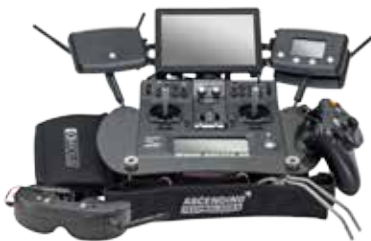
▼ Mobile Ground Station, video goggles, high quality preview monitor & Independent Camera Control.

Critical situations will clearly be indicated to the pilot from the Mobile Ground Station with visual (German/English) and acoustic warnings.